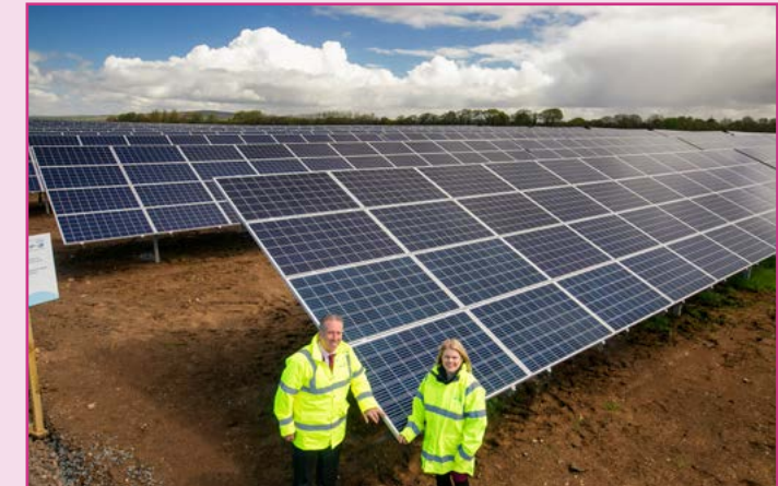
NI Water CEO at the Dunore solar farm, County Antrim.

We deployed our first battery energy storage system at Ballykelly wastewater treatment works, County Derry/Londonderry in 2022/23. The battery system enables the treatment works to operate using on site solar power for much of the year. In winter months, during periods of lower solar generation, the battery system can be topped up from the grid using off-peak cheaper energy tariffs. Reed beds are used as part of the treatment process, which scooped a 2022 International Green Apple Environment Award and