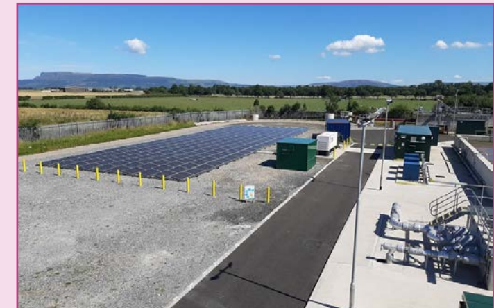
Solar powered battery energy system at Ballykelly wastewater treatment works, County Derry/Londonderry.

was named Infrastructure Project of the Year at the 2022 ICE Sustainability Awards and the CEF Construction Excellence Awards.