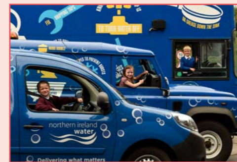
Educating water whizz-kids through our Waterbus initiative.

The Education Team has been visiting schools to deliver the key messages of water efficiency, water for health and bag it and bin it. The team has also developed several new lessons to engage pupils with the wonderful world of water including a climate change escape room and the wonders of peat bogs presentation.