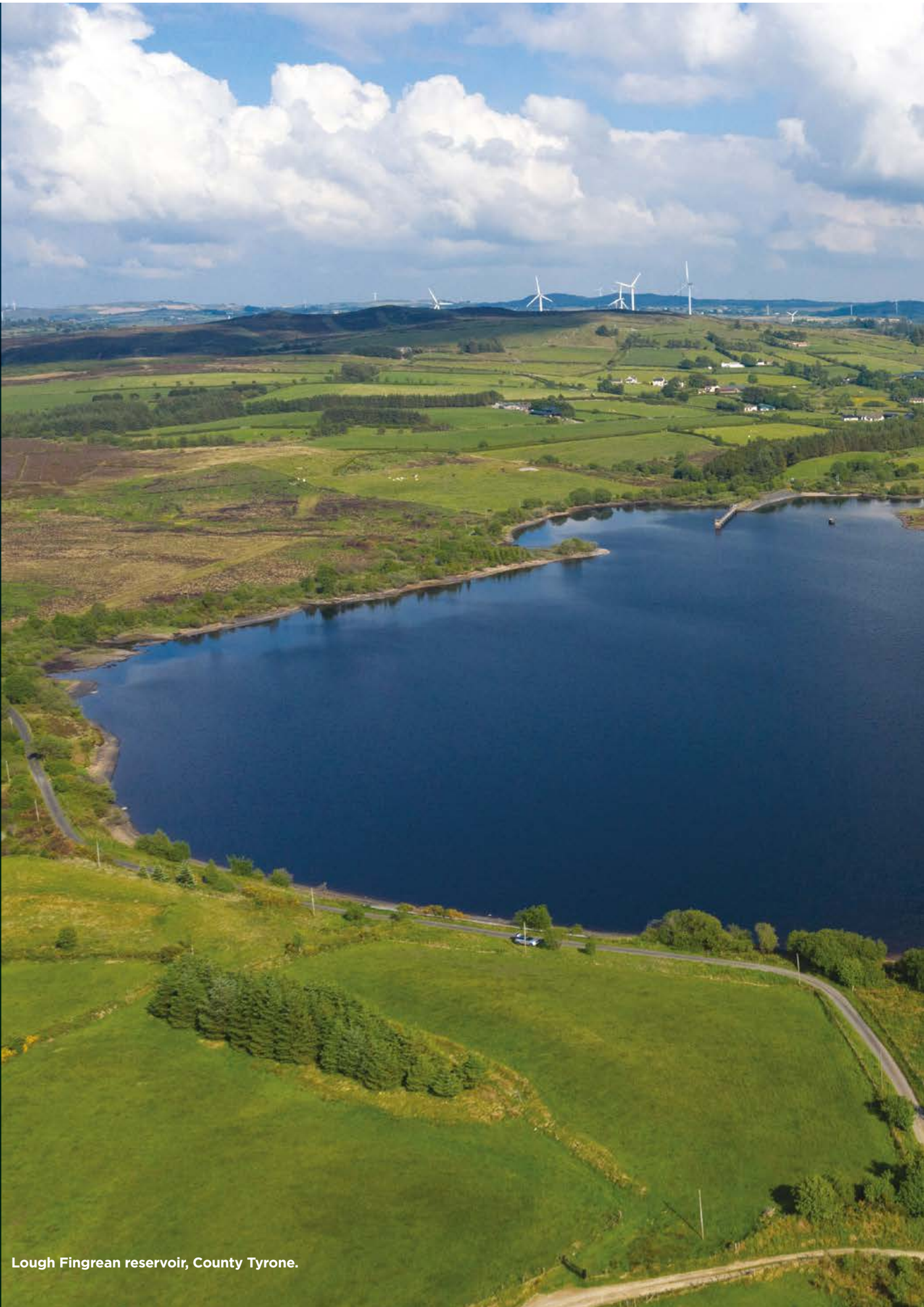
Lough Fingrean reservoir, County Tyrone.