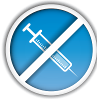
Syringes / Needles