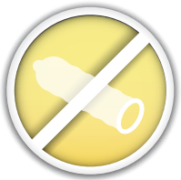
Condoms / Femidoms