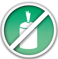
Facial / Baby wipes