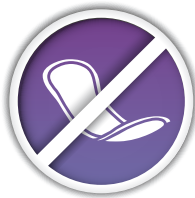
Sanitary towels / Panty liners / Incontinence Pads