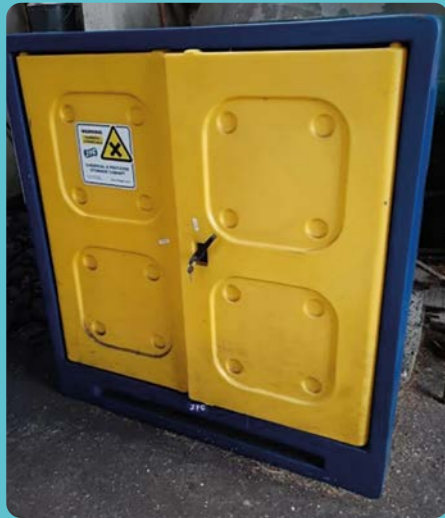
Pesticide storage unit

Farmers within the Seagahan Water catchment area can express an interest in as many or as few of the listed options available, as detailed below: