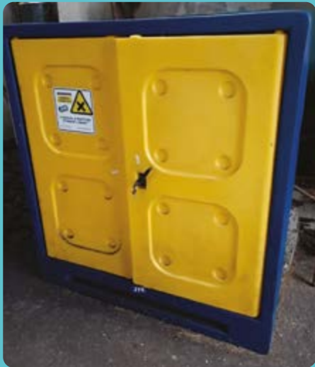
Pesticide storage unit

Farmers within the Clay Lake Water catchment area can express an interest in as many or as few of the listed options available, as detailed below: