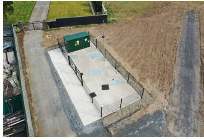
Benone Ave North WwPS