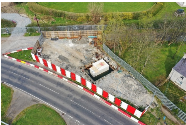
Benone Avenue South WwPS

Meanwhile, at the Benone Avenue South WwPS site, the new pump sump, which measures 2.2m x 2.5m x 5.75m deep, has been constructed.