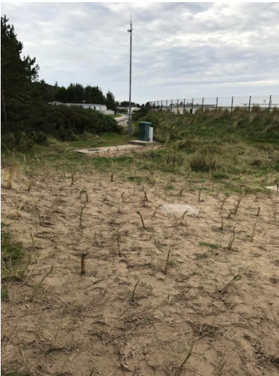
Improvement works carried out at the existing vacuum pot adjacent to Golden Sands Beach Site