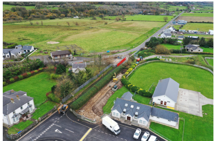
Pipelaying at Deighan's Caravan Park