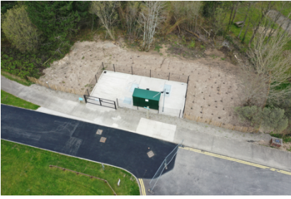
Benone Tourist Complex WwPS