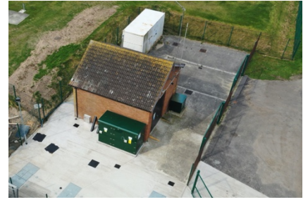
Benone One WwPS