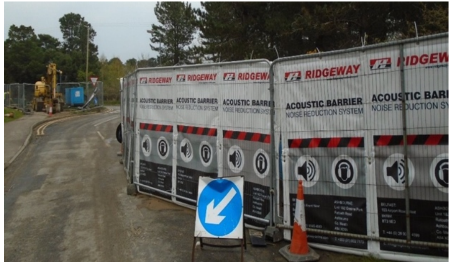
Noise protection around dewatering pumps during pipelaying