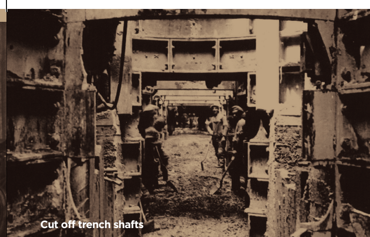
Cut off trench shafts