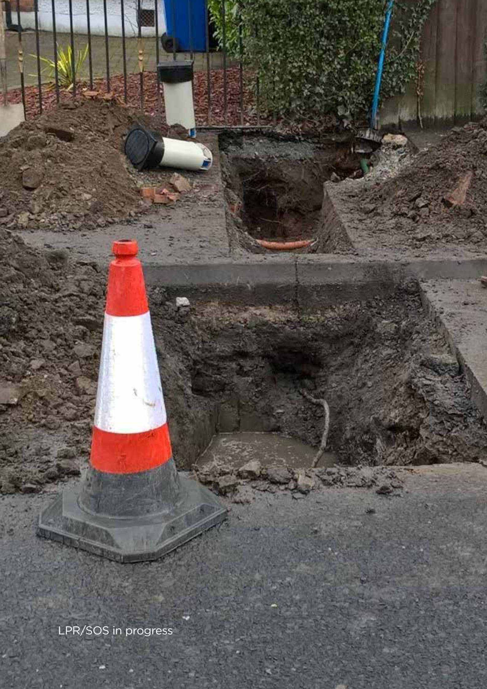
LPR/SOS in progress