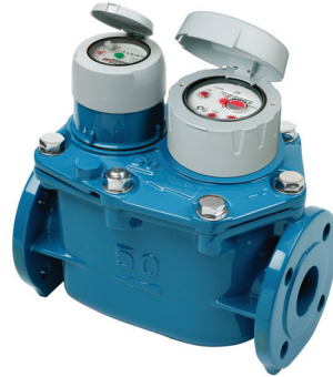
Combination meter with 2 dials