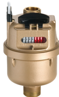
Small Diameter Meter types