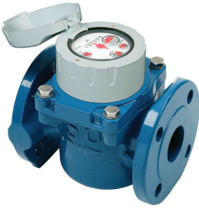
Large Diameter Meter