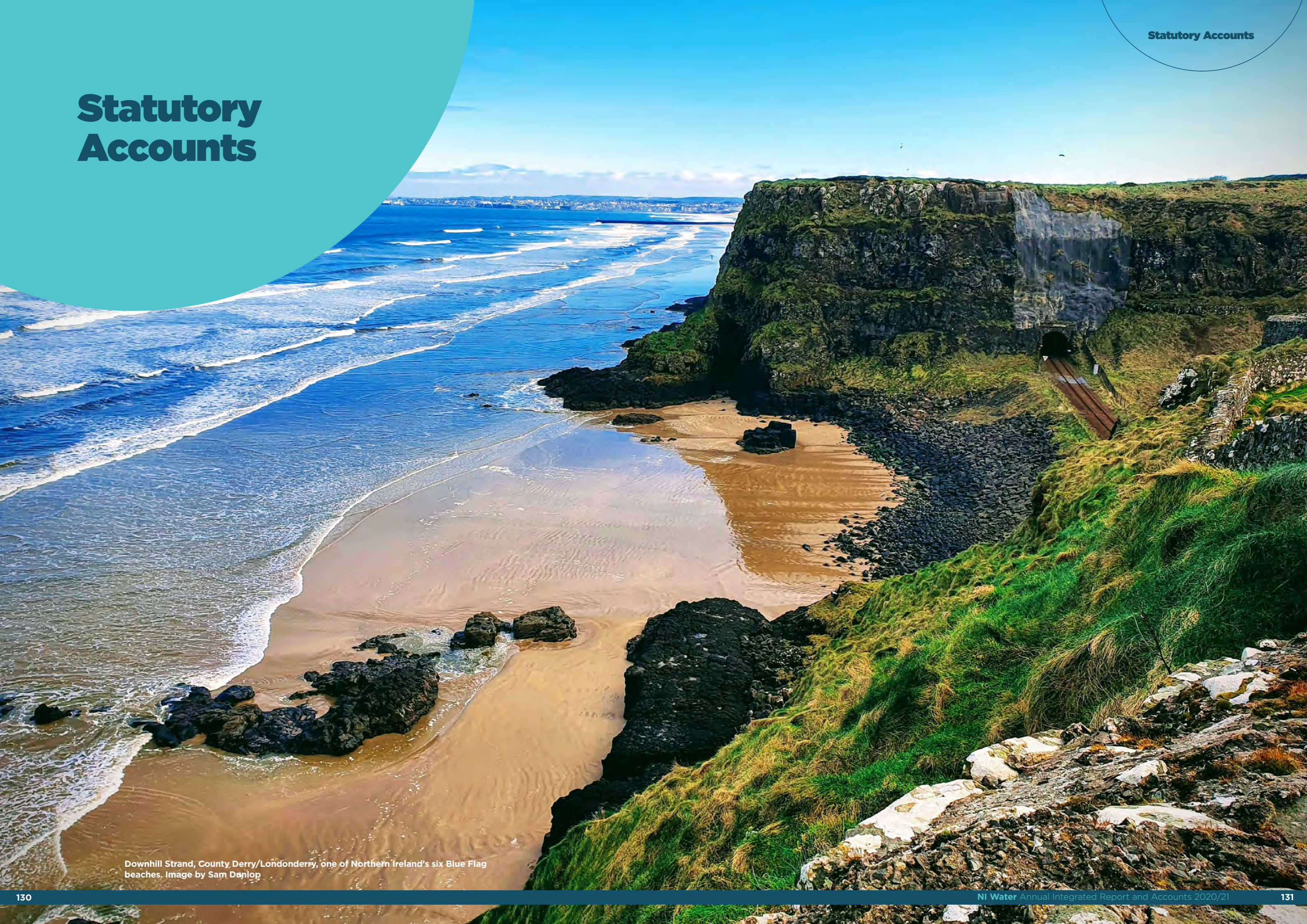
Downhill Strand, County Derry/Londonderry, one of Northern Ireland's six Blue Flag beaches.