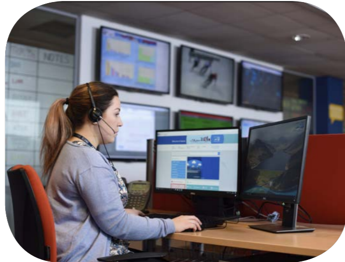
NI Water Customer Relations Centre.

We offer a range of free additional services if you have a disability, are an older consumer, have a serious medical condition or need extra help for any other reason. The demand for these services will likely increase given the rise in the over 65 age group by the 2040's - making up 25% of the population. We will identify our customers who need additional support and grow our Customer Care Register to meet these changing needs.