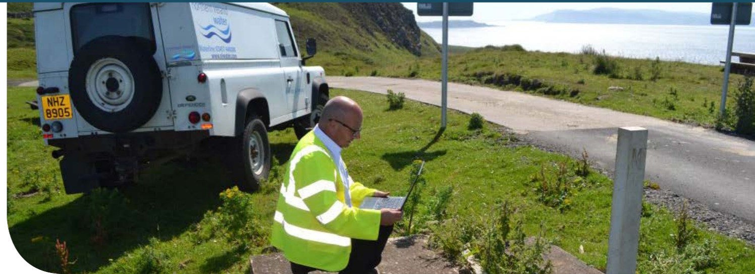
NI Water staff member on Rathlin Island configuring a smart meter.

We collect a wealth of data on the operation of our assets. Automated, semi-automated or human-assisted channels will enable us to detect issues that may affect our service before customers are even aware, so our skilled operatives can intervene early and prevent the service failure. If a service failure cannot be prevented, we will use our data to issue updates to affected customers removing the need for our customers to contact us.