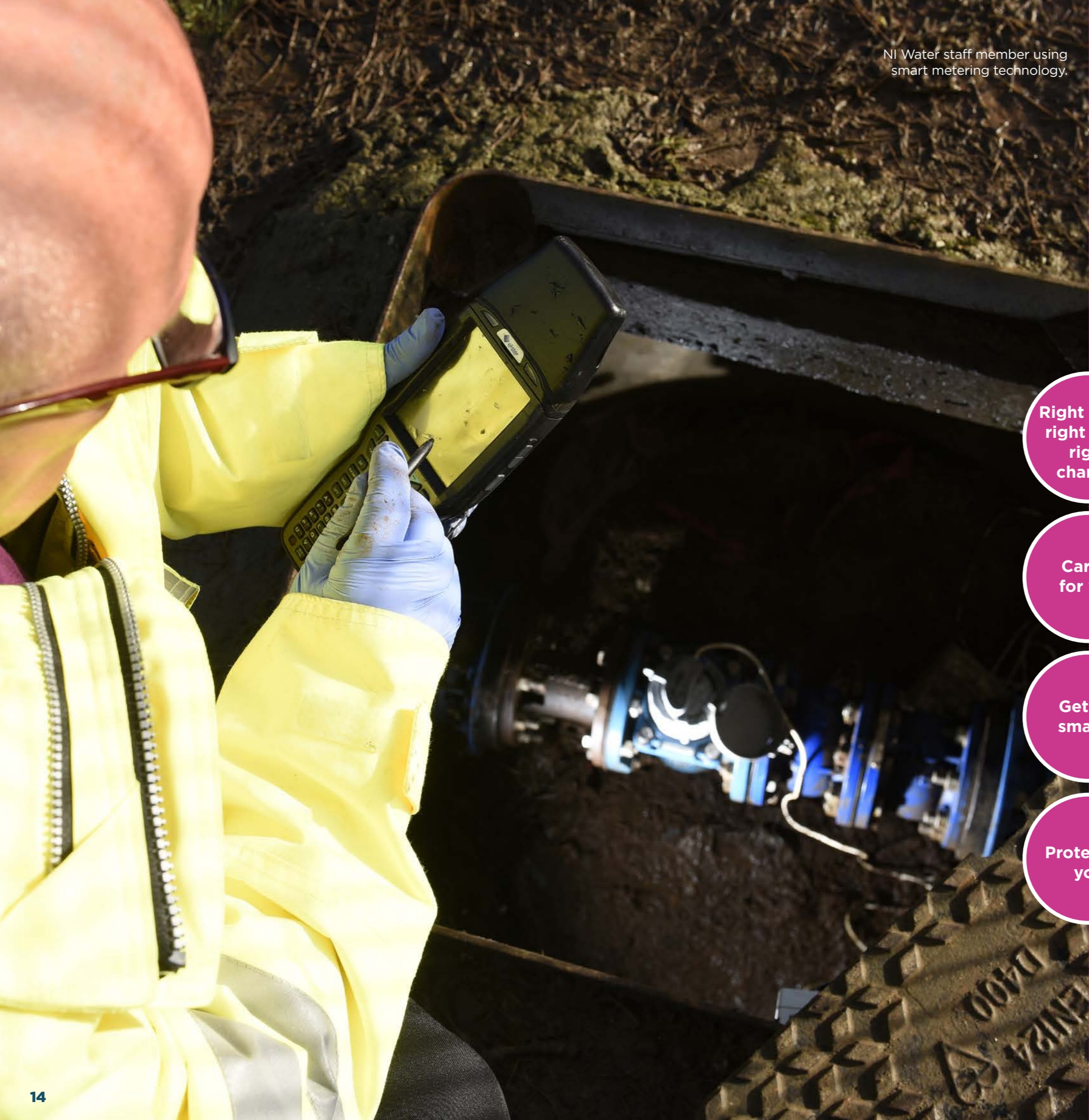
NI Water staff member using smart metering technology.